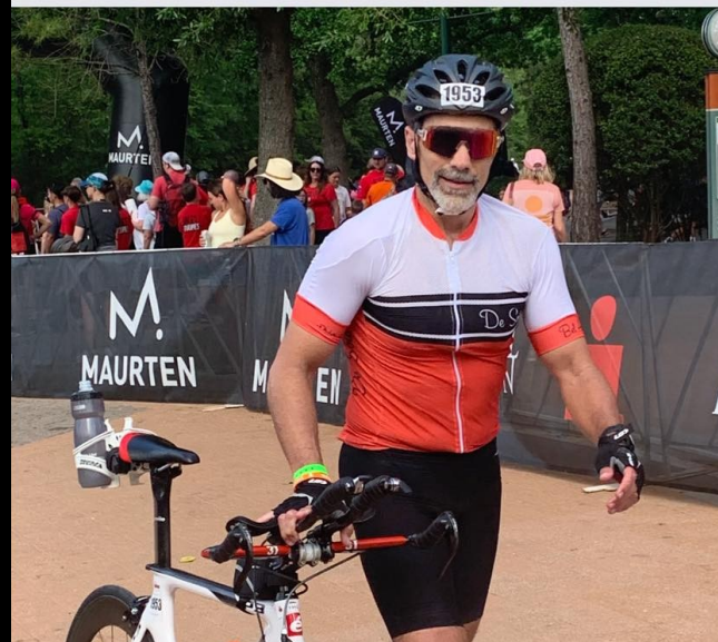
112-mile Bike Ride